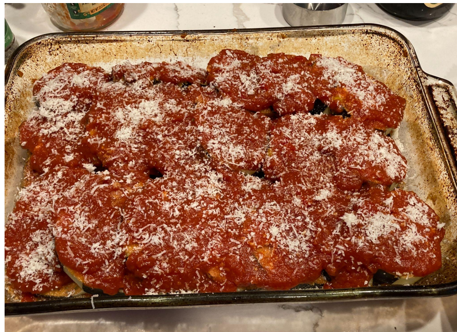
Photo was taken before cooking and being topped with mozzarella